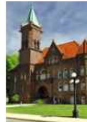
Barbour County Courthouse

Click on courthouse photos below for specific county information.