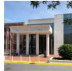
Berkeley County Courthouse