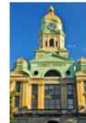
Cabell County Courthouse