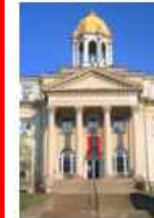
Boone County Courthouse