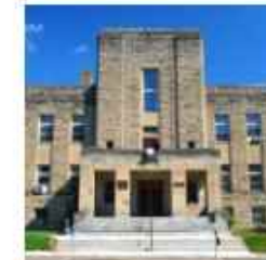
Calhoun County Courthouse