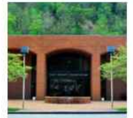
Clay County Courthouse