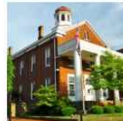
Brooke County Courthouse