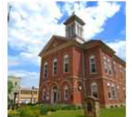
Braxton County Courthouse